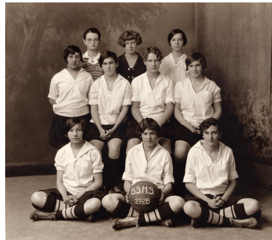
The above photograph is of the 1927-1928 Underclass/Alternate Team of Bay Shore High School. Do you know any of the athletes pictured? More information about this photo is on page 3 of this newsletter. Remember to stop by 22 Maple Ave. on any Tuesday or Saturday between 1pm and 4pm, always free of charge, to view and peruse the Society's collection of Bay Shore photographs, memorabilia, documents, postcards, books, and informative displays.