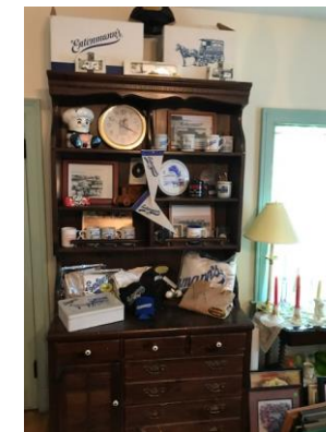
The current Entenmann's display at the Bay Shore Historical Society.