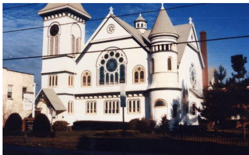
The United Methodist Church located at East Main St. and Second Ave. The Queen Anne style edifice dates back to 1869.