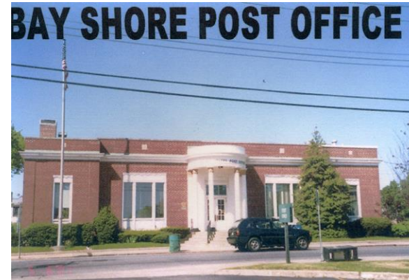
The Bay Shore Penataquit Post Office located at 10 Bay Shore Ave. Built during the years 1933 – 1935, the lobby features the relief sculpture Speed crafted by Wheeler Williams.