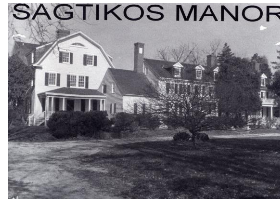
Sagtikos Manor located on Montauk Highway in Bay Shore's western section. Was built in the 17 th century and remodeled about 1902. Contact the Sagtikos Manor Historical Society for hours for visiting and touring.

Visit the Bay Shore Historical Society at 22 Maple Ave. on Tuesdays and Saturdays between 1 pm and 4 pm to learn more about the above buildings. The Society's collection of materials, post cards, Bay Shore School yearbooks, pictures, and memorabilia is available for perusal and study free of charge.