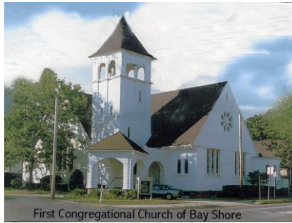
The First Congregational Church located on Union Blvd, at the corner of Fourth Ave. constructed in 1891 and features stained glass by LaForge and Tiffany as a ceiling built by ships' carpenters in the style of an old seafaring vessel.