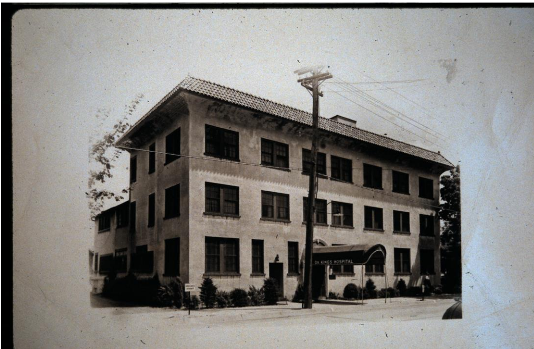
Dr. King's Hospital – formerly located on Maple Ave., just south of Gibson Ave.