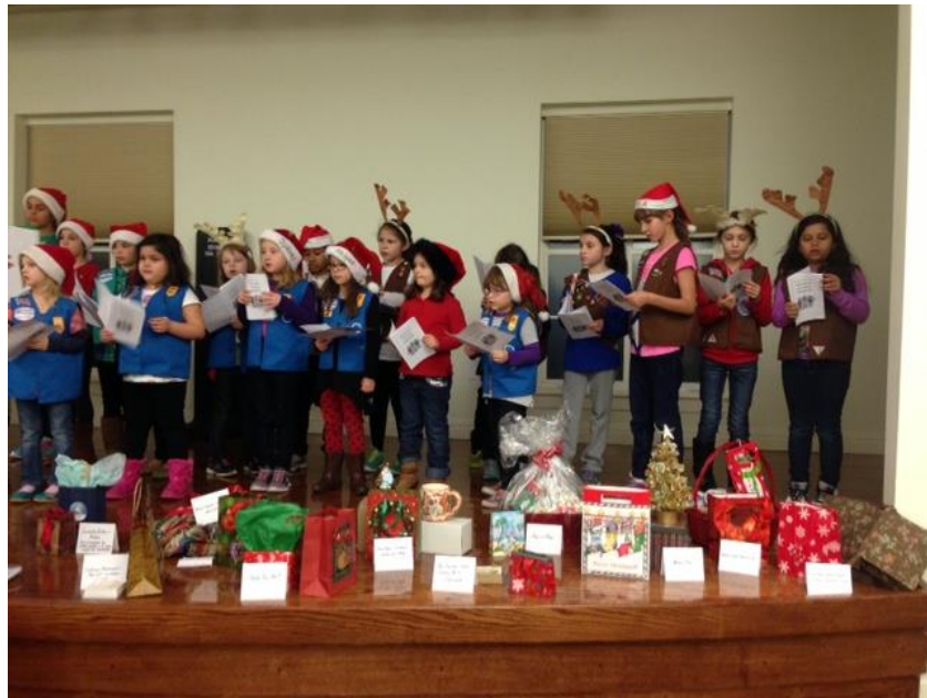
Some of the Girl Scouts and Brownies who entertained Society members and guests at the Pot Luck Dinner held at the Bay Shore-Brightwaters Library in December 2014.